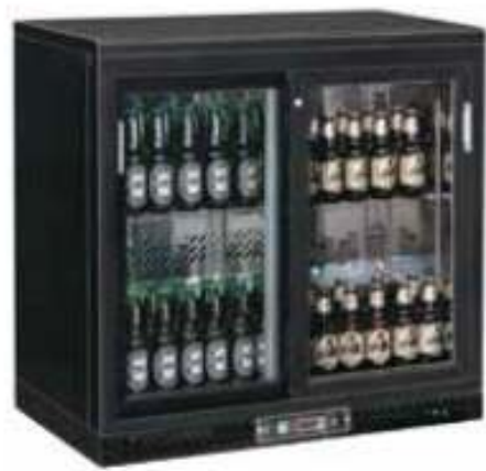
BC2PS (+2° +8°C)