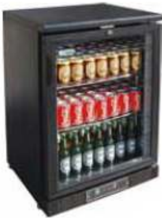
BC1PB (+2° +8°C)