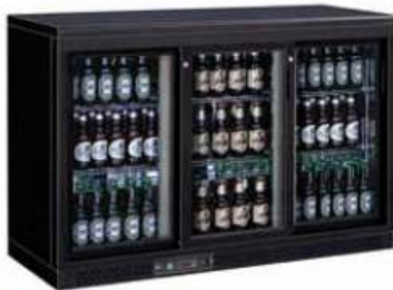
BC3PS (+2° +8°C)